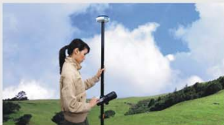
Measuring and staking out points