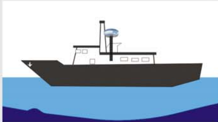
Navigating and positioning on surveying and dredging boats